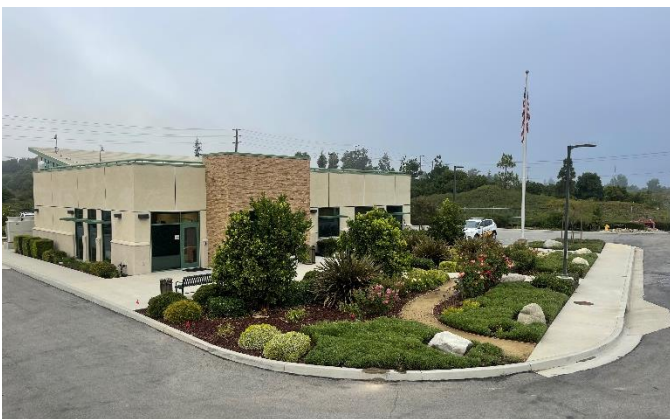
Ventura County Waterworks District Laboratory & Reclamation Facility

Drinking water, including bottled water, may reasonably be expected to contain at least small amounts of some contaminants. The presence of contaminants does not necessarily indicate that the water poses a health risk. More information about contaminants and potential health effects can be obtained by calling the USEPA's Safe Drinking Water Hotline (1-800-426-4791).