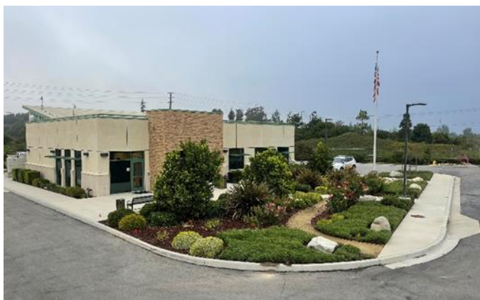
Ventura County Waterworks District Laboratory & Reclamation Facility

Drinking water, including bottled water, may reasonably be expected to contain at least small amounts of some contaminants. The presence of contaminants does not necessarily indicate that the water poses a health risk. More information about contaminants and potential health effects can be obtained by calling the USEPA's Safe Drinking Water Hotline (1-800-426-4791).