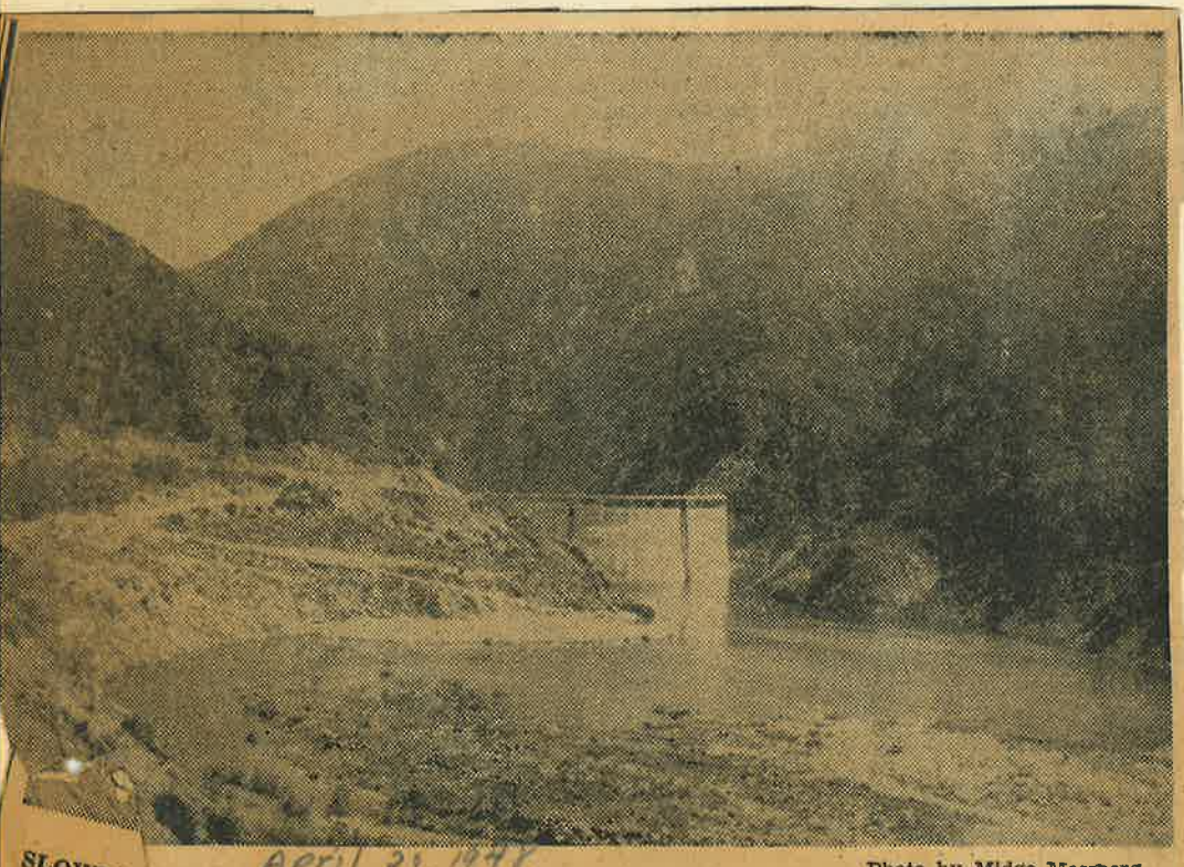
Photo by Midge Mossberg stretching be into the canyon area. This scene shows the dam with about 250 acre feet of water sowed. 300 ainds of coarse salt as a new test was started to determine leakage of the dam's foundation.

If we make haste slowly in this period of seeming slow motion, and come out with a right result next time, the present lull can be cheerfully forgiven.